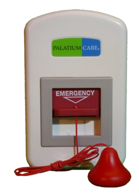
Part No. PAL-203200